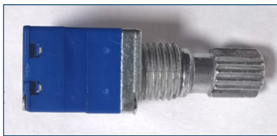
Existing Marking Position

In order to fit the requirements for the new automated assembly, the component's marking position will be slightly modified as depicted below. The electrical and mechanical performance of the product will continue to meet the existing data sheet specifications. The fit, function, and quality of the affected product will remain the same. The reliability should be improved. The form is changed because of the change in the marking position.