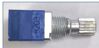
New Marking Position